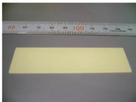
Figure 2. Photograph of a rectangular solid DGAG.

Magnetic refrigerant of DGAG particles with 0.4 mm diameter shown in Fig. 3 was packed into a cylindrical sample holder with 40 mm in diameter and 100 mm in length. A teflon sealing ring between the sample holder and outer cylinder forced heat transfer gas to flow through the regenerator bed.