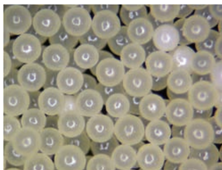
Figure 3. Photograph of spherical DGAG particles.

Figure 4 shows the experimental results on the temperature change of magnetic material at upper and lower side of regenerator bed during the AMR cycle operation. AMR bed was driven linearly with a stroke of 200 mm between the field center and weak field area by the drive motor. The total cycle period was 8 s that consisted of 2 s magnetization and demagnetization process and 2 s waiting time between every field change. Helium gas was used as heat transfer fluid at a pressure of 0.1 MPa. At the beginning of AMR operation, there was no temperature span. A temperature span was developed by driving the AMR bed and becomes steady within about 300 seconds. The obtained temperature span in AMR bed was increased with increasing magnetic field because of the increase of magnetocaloric effect. The temperature span was also increased with the increase in the pressure of transfer gas due to good heat transfer. After the AMR operation was stopped, the temperature span in the AMR bed rapidly diminished, indicating that large heat leak existed. However, AMR cycle was confirmed to expand temperature span at least two times larger than the adiabatic temperature change of DGAG around 20 K in spite of large parasitic heat leak .