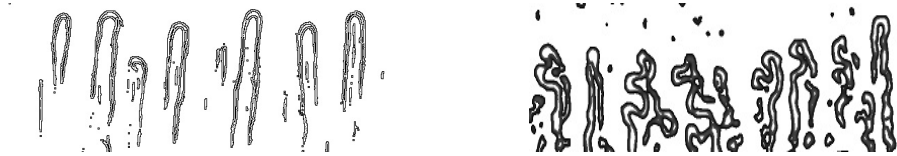
Figure 2: The result of image processing of Figure 1, (Left) normal capillaries, (Right) abnormal capillaries.

In the images, there are areas where the capillaries are clearly visible and areas where they are smeared. This is due to change of transparency of the liquid around the capillary, depending on the health condition. Information on this transparency may also become an indicator of health condition, but we treat here the shape of capillaries only. Health condition can be estimated from the curvature of the contour of the capillary. The extraction of the contour of capillary is carried out from the relatively clearly visible area. To do this, we have used the free software GIMP (see Figure 2).