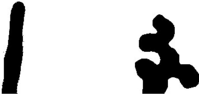
Figure 4: The results of (B1), (Left) normal capillary, (Right) abnormal capillary.

(B2) By using the level set equation, we perform isotropic smoothing of the capillary edge.