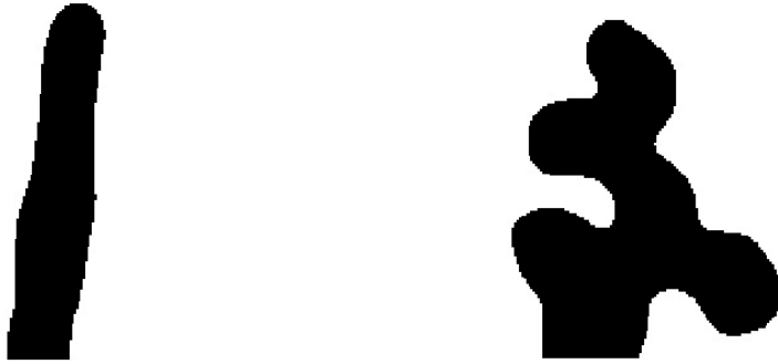
Figure 5: The results of (B2) (100 time steps), (Left) normal capillary, (Right) abnormal capillary.

Since the irregularities are eliminated, the curvature of the boundary can be calculated precisely. If we continue the numerical computation further more, the image is blurred. Figure 6 shows the shape after 500 time steps of numerical calculation.