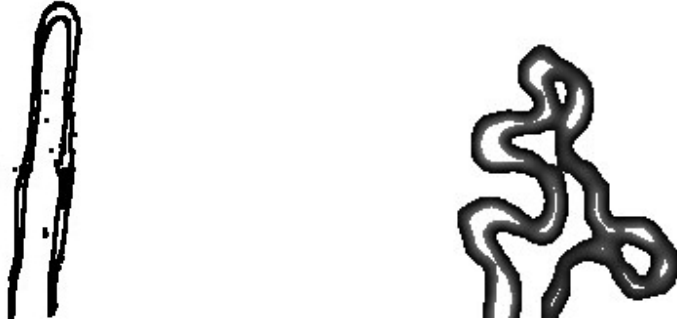
Figure 3: Two distinctive capillaries, (Left) normal capillary, (Right) abnormal capillary.

called “normal” and the right one “meandering”. Throughout this paper, we assume that the scale size of these two pictures is the same.