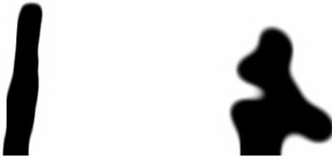
Figure 6: The results of (B2) (500 time steps), (Left) normal capillary, (Right) abnormal capillary.

Since the irregularities are eliminated, the curvature of the boundary can be calculated precisely. If we continue the numerical computation further more, the image is blurred. Figure 6 shows the shape after 500 time steps of numerical calculation.