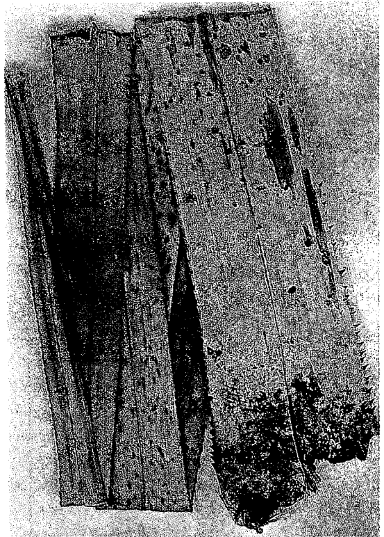
Fig. 1. Pandanus furusei HATUSIMA (holotype)

promote praeter basim versus remotiuscule serrata. Syncarpia 9, ad usque apicem peduncule racemosim triseriatimque disposita (spica ca. 30 cm. longa); syncarpium elongato-ellipticum intus ± complanatum, in sicco ca. 10 cm. longum et 5 cm. latum, pedunculis fructiferibus ca. 5 cm. longis. Phalanges numerosae subprismaticae in sicco 2.3-2.5 cm. latae, 1.3-2.0 cm. latae, plerumque sexangularis, apice truncatae, loculis 6. Endocarpium osseum lineari-oblongum 5-7 mm. longum et 1.5-2 mm. latum usque ad medium situm. Stigmata parva plerumque 6, ca. 1 mm. lata. Spadices mas-