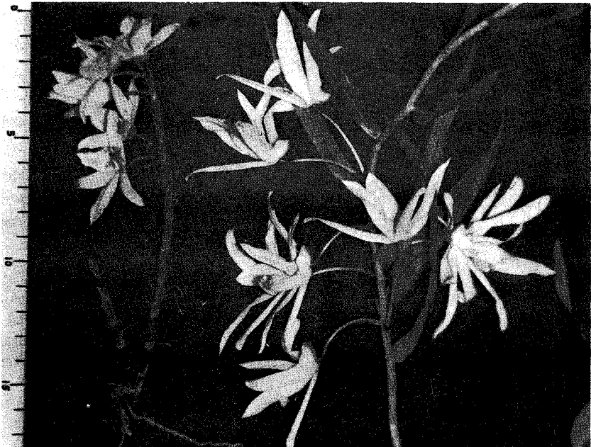
Fig. 3. The flowering stems of Dendrobium okinawense (right) and D. moniliforme (left)

1.2-1.5 cm lata, glabra. Flores ad nodos superiores plerumque bini, alba vel albo-rosea. Pedicellis cum ovaris 4 cm longis leviter recurvis. Sepalum medicum late lineare 4-4.3 cm longum, 6.5-7mm latum, apice obtusum, lateralia late linearis vel