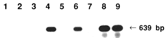
Figure 3. IL-6 mRNA analyzed by PCR amplification. Naive (lanes 1-4) and memory (lanes 5-8) CD4 + T cell populations were cultured with various stimulants for 12 h. As described in Materials and Methods, amplified products of IL-6 mRNA were prepared, electrophoresed, transferred onto a nitrocellulose membrane, and hybridized with IL-6 cDNA. The amount of applied samples of LPS-stimulated PBMC (lane 9) as a control was equivalent to one-fifth of those of CD4 + T cells. Stimulated culture conditions are as follows. (Lanes 1 and 5) medium; (lanes 2 and 6) anti-CD2 mAbs; (lanes 3 and 7) LPS; (lanes 4 and 8) PHA plus PMA (lane 9) PBMC stimulated with LPS.

CD4 + T subpopulations were incubated at a concentration of 2.5 \times 10^6 cells/ml with a combination of anti-T11 2 and anti-T11 3 mAbs (1/500 dilutions) or PHA plus PMA. Culture supernatants were collected after 36 h of incubation, and IL-6 activity was measured by the growth of IL-6-dependent murine hybridoma clone, MH60.BSF2.