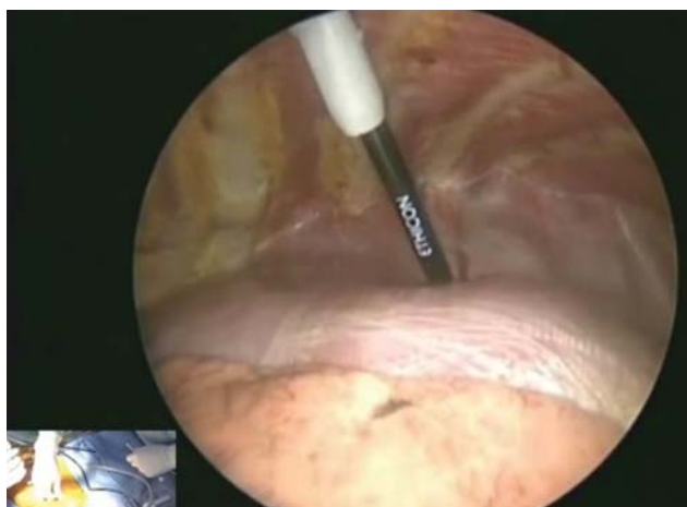
Video 1: Preoperative computed tomography scan and placement of the thoraco-ports.