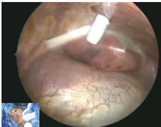
Video 2: Extraction of the resected middle lobe trans-diaphragmatically through the subcostal incision and the closure of the subcostal incision.

maintain CO 2 insufflation and dispense with the need to insert larger-sized instruments through intercostal port sites [4]. We adopted this procedure in VATS. We used only three 5-mm intercostal ports, through which we could insert ordinary VATS devices, thereby making our procedure less invasive than robotic ports. Long endostaplers and roticulated forceps for encircling the bronchus and pulmonary vessels were useful. Our approach facilitates the handling of stapling devices without the interference of other devices and the camera.