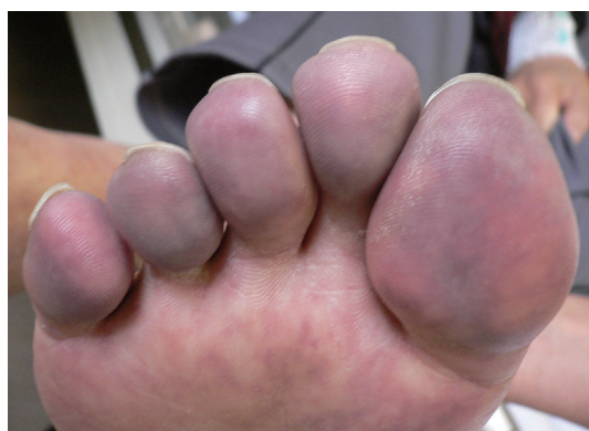
Figure 1. Cyanosis of the right toe.

PT: Prothrombin time, APTT: activated partial thromboplastin time, FDP: fibrin and fibrinogen degradation products.