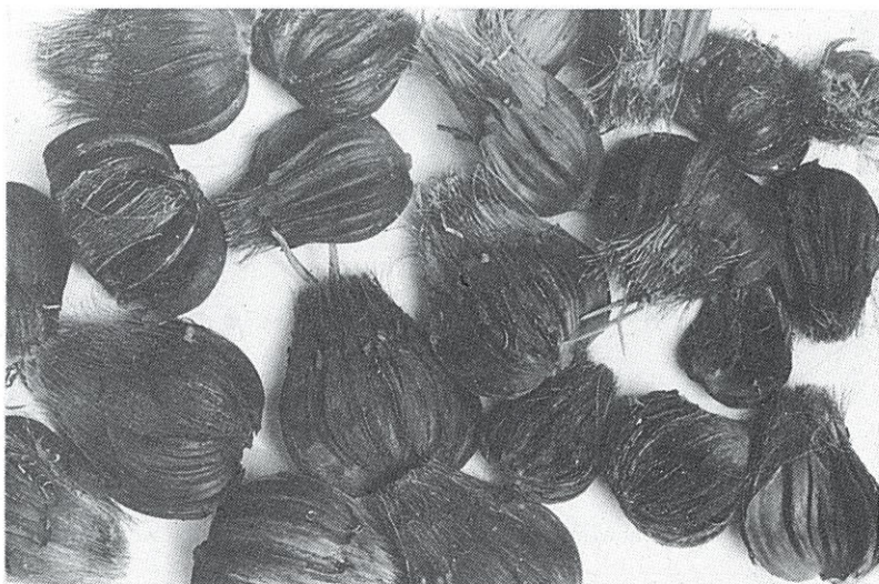
Fig. 2. Fruits of Nyssa fruticans washed ashore on the coast of Tokoname City, Aichi Prefecture (Mar. 24. & 25. 1979).

19. Onizaki to Ohnomachi, Tokoname City, Aichi Pref.; N. fruticans 1 (Jan. 1. 1979), 27 (Mar. 24. & 25. 1979), 8 (Apr. 2. 1979), 1 (July 22. 1979), 1 (July 27. 1979), 1 (Dec. 30. 1979), 1