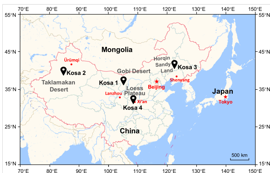
Fig. 1. Locations of the geographic origin of Kosa samples. Sample Kosa 1 was collected from the Gobi Desert (105.4°E, 38.5°N, Inner Mongolia, China), Kosa 2 was from the Taklimakan Desert (84.3°E, 40.2°N, Xinjiang, China), Kosa 3 was from the Horqin Sandy Land (122.3°E, 43.0°N, Inner Mongolia, China) and Kosa 4 was from the Loess Plateau (108.9°E, 34.5°N, Shaanxi, China).

The Kosa samples used in this study were collected from different Asian deserts, including the Gobi Desert, Taklimakan Desert, Horqin Sandy Land and Loess Plateau. Locations of the sampling sites are shown in Fig. 1 . The particle size, specific surface area, and porosity of the Kosa samples were measured. Moreover, fifteen metallic elements and nine water-soluble inorganic ions of each Kosa sample were detected.