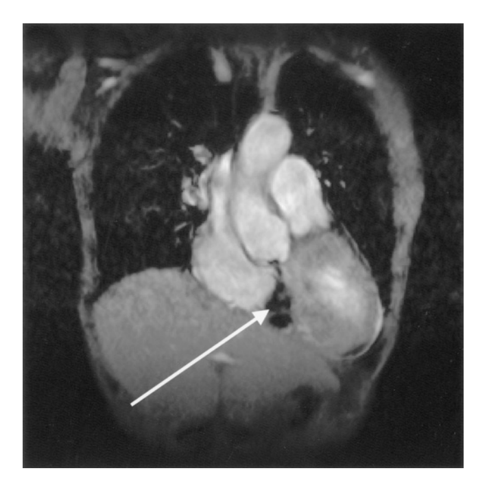
Figure 1. Cine MRI image. An abnormal flow drained from aorta into the RA is seen (arrow).

Key words: Valsalva, aneurysm, rupture, magnetic resonance imaging (MRI), multislice computed tomography, echocardiography