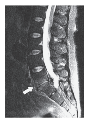
Figure 1. Sagittal magnetic resonance image of the lumbar spine showed L5/S1 osteomyelitis (arrow).

5.1 mg/dL. Rapid diagnostic test for influenza A and B was negative. Although urine immunochromatographic membrane assay for S. pneumoniae (Binax NOW<sup>®</sup> Streptococcus pneumoniae, Binax Inc., Scarborough, ME, USA) was positive, chest X-ray showed no abnormalities. Acute bronchitis due to S. pneumoniae was diagnosed. Blood culture was not performed. One gram per day of intravenous pazufloxacin mesilate was started. On day 3, severe low back pain acutely occurred and she could not walk because of the pain. She was eager to increase the prednisolone dosage to alleviate the excruciating back pain. On day 6, the dose of prednisolone was increased to 40 mg per day and was somewhat effective. She could walk and the fever subsided. On day 10, administration of pazufloxacin mesilate was discontinued. However the low back pain persisted. She was transferred to our hospital for further examination and treatment on day 20. On physical examination, temperature was 38.0°C, blood pressure 166/96 mmHg, pulse 75 beats per minute, and respiratory rate 20 per minute. She complained of back pain. Nuchal rigidity was absent. Chest and abdominal examinations showed no abnormalities. Psoas signs were negative bilaterally. Tenderness over the spine was not observed. Laboratory findings are shown in Table 1. No