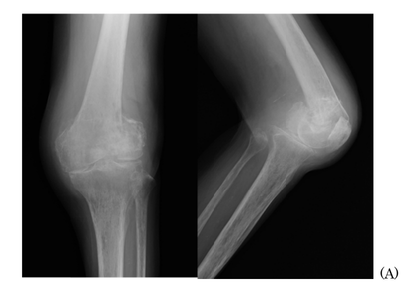
Fig. 1 (A) Anteroposterior and lateral radiographs showed a displaced comminuted supracondylar and intercondylar fracture. (B) Coronal CT scan images revealed extensive comminution of the bilateral condyle and avulsed fragments of the collateral and cruciate ligaments.