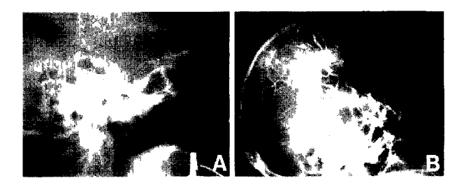
Fig. 1 A: Plain skull roentgenogram of Case 1 showing erosion of the sellar floor, possibly attributable to long-standing increased intracranial pressure. B: The lateral view of the right carotid angiogram disclosing the sunburst appearance of the parietal convexity meningioma, which is supplied by the enlarged, tortuous superficial temporal artery as well as the middle meningeal and anterior and middle cerebral arteries.

hyperostotic area. The tumor was round, soft, elastic, and bloody and measured approximately 5 cm in diameter. It was fairly well demarcated, from the surrounding edematous brain. Some portions of the mass adhered to the dura, and it was removed en bloc with the dura. The histological diagnosis was meningotheliomatous meningioma with occasional whorls and psammoma bodies.