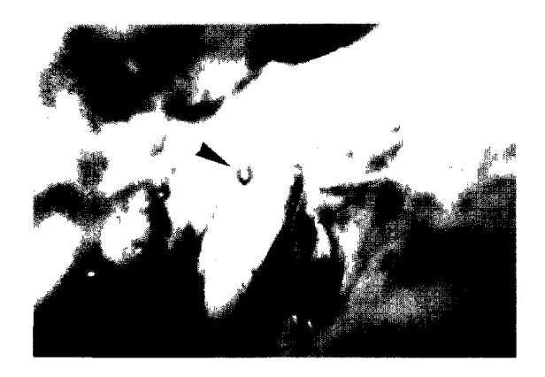
Fig. 4 An intraoperative photograph of Case 2 reveals a fistula at the right cribriform plate (arrow). The right olfactory nerve is also shown (arrowhead).

The CSF rhinorrhea ceased immediately after the