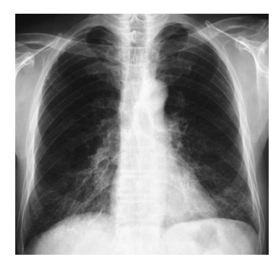
Figure 1. Chest X-ray film obtained upon admission in February 2005 shows volume loss and reticular shadows in both lower lungs.

in February 2005. At approximately the same time, bilateral wrist-hand arthralgia appeared. He was then admitted to our hospital for detailed examination.