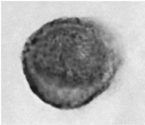
Figure 3. Immunocytochemical staining for sialyl-Lewis A antigen (sLe A ) in the Capan-1 pancreatic cancer cell line. SLe A antigen was expressed on the cell surface of Capan-1 cells.

had no significant effect on TNF- \alpha expression at any of the time intervals examined (Fig. 2).