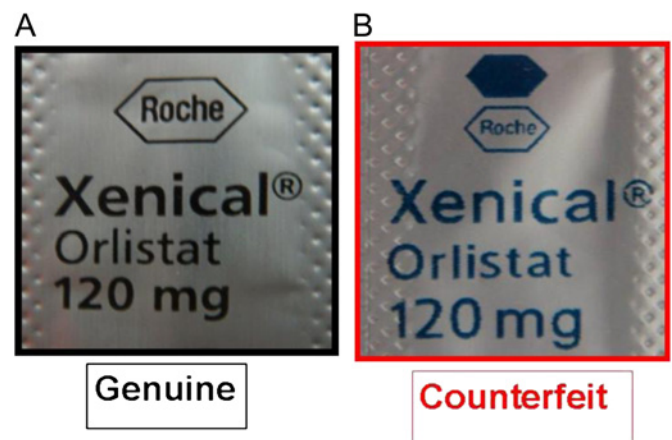
Figure 3 Reverse side of blister: (A) logo of genuine sample and (B) logo of counterfeit sample.