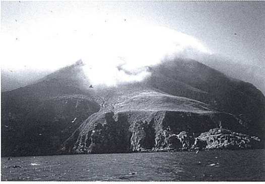
Fig. 2. Chirinkotan Island seen from the north.