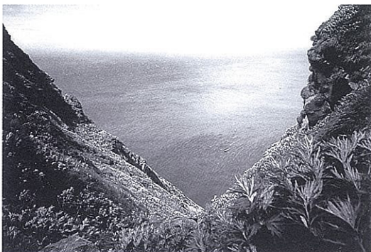
Fig. 3. Gully on the northwest side of Chirinkotan.

Co-operative field work between Japan, Russia and the USA was performed on the island under the auspices of the International Kuril Island Project (IKIP). On August 10, 1996, five botanists from the three countries landed at a small inlet just east of Cape Ptichy, on the northwest corner of the island (48°59.30' N latitude, 153°28.28' E longitude). They collected vascular plants along the seacoast and up a small gully (Fig. 3), but could not reach high altitude be-