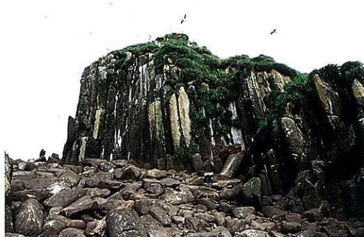
Fig. 3. Rocky cliffs along the sea coast of the Lovushki Rocks, the middle Kurils (Aug. 3, 1997,).