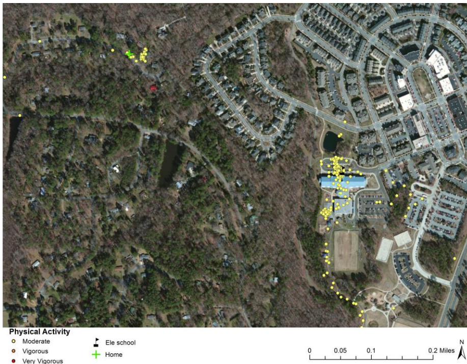
Figure 3. One girl school of the new urbanist area had to be driven to school because of no connectivity