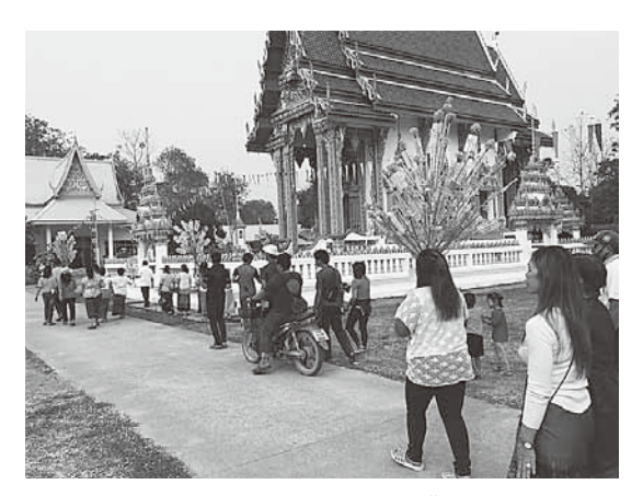
Figure 3: A Parade of "Trees" (Ton Phapa) Organized head to the Receiver's Temple

There are two major routes of Phapa that have most often been organized from Pang Moddaeng. They are called the "South Route"