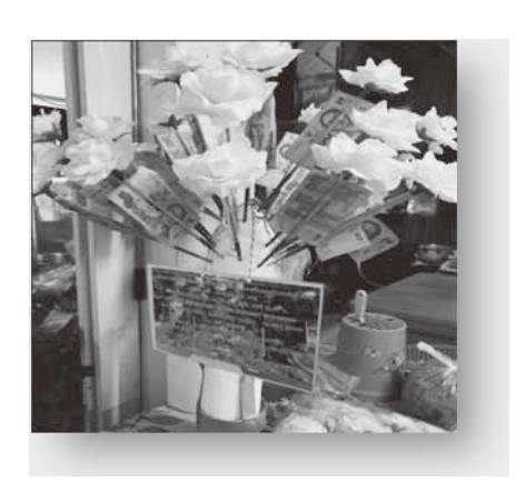
Figure 4: Collection 'tree' ( Ton Phapa ) Date: 11 Sep 2018

Before analyzing how Todd Phapa is meant to the community and serves various