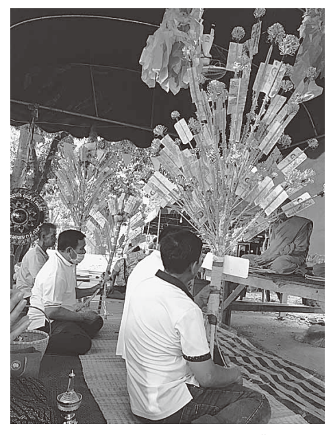
Figure 2: The Villagers offer the "Trees" ( Ton Phapa ) to the Monks of the Receiver's Temple Date: 3 Mar 2021

The last organizational step concerns the creation of the collection 'trees' ( Ton Phapa ), which can then be placed in various locations in order for people to attach money or other specified items to them. Several days prior to the Phapa day, the Ton Phapa will be collected and prepared for transfer to a receiver. (Figure 2)