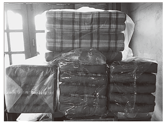
Figure 5: Isan pillows ( Mhon Khid ) Date: 9 Sep 2018

purposes, next section, I illustrate a history of Pang Moddaeng that shows when and how they had faced with the limitation and difficulty. (Figures 4 and 5)